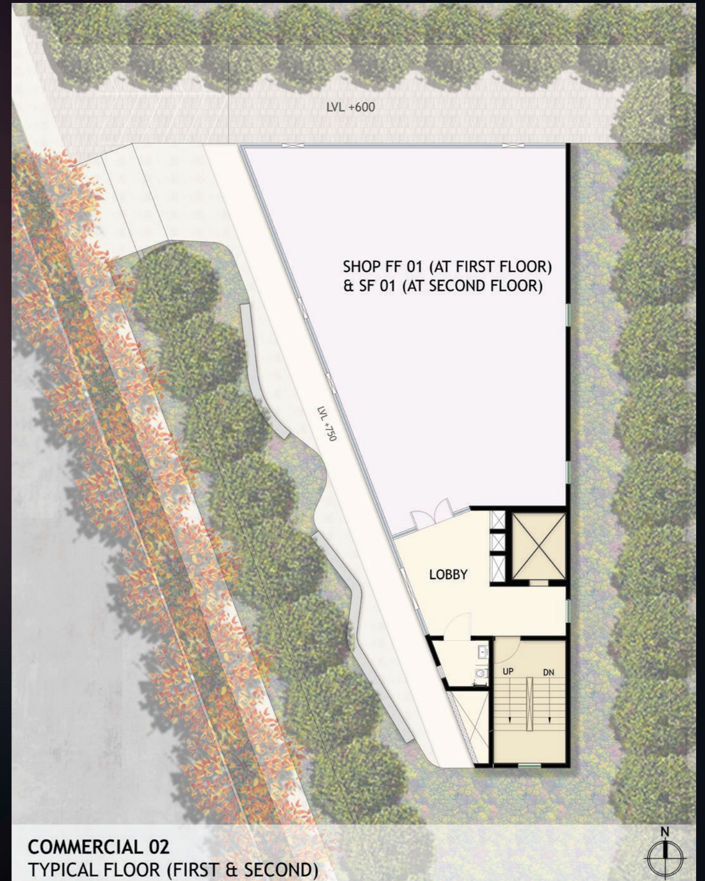
COMMERCIAL 02 TYPICAL FLOOR (FIRST & SECOND)