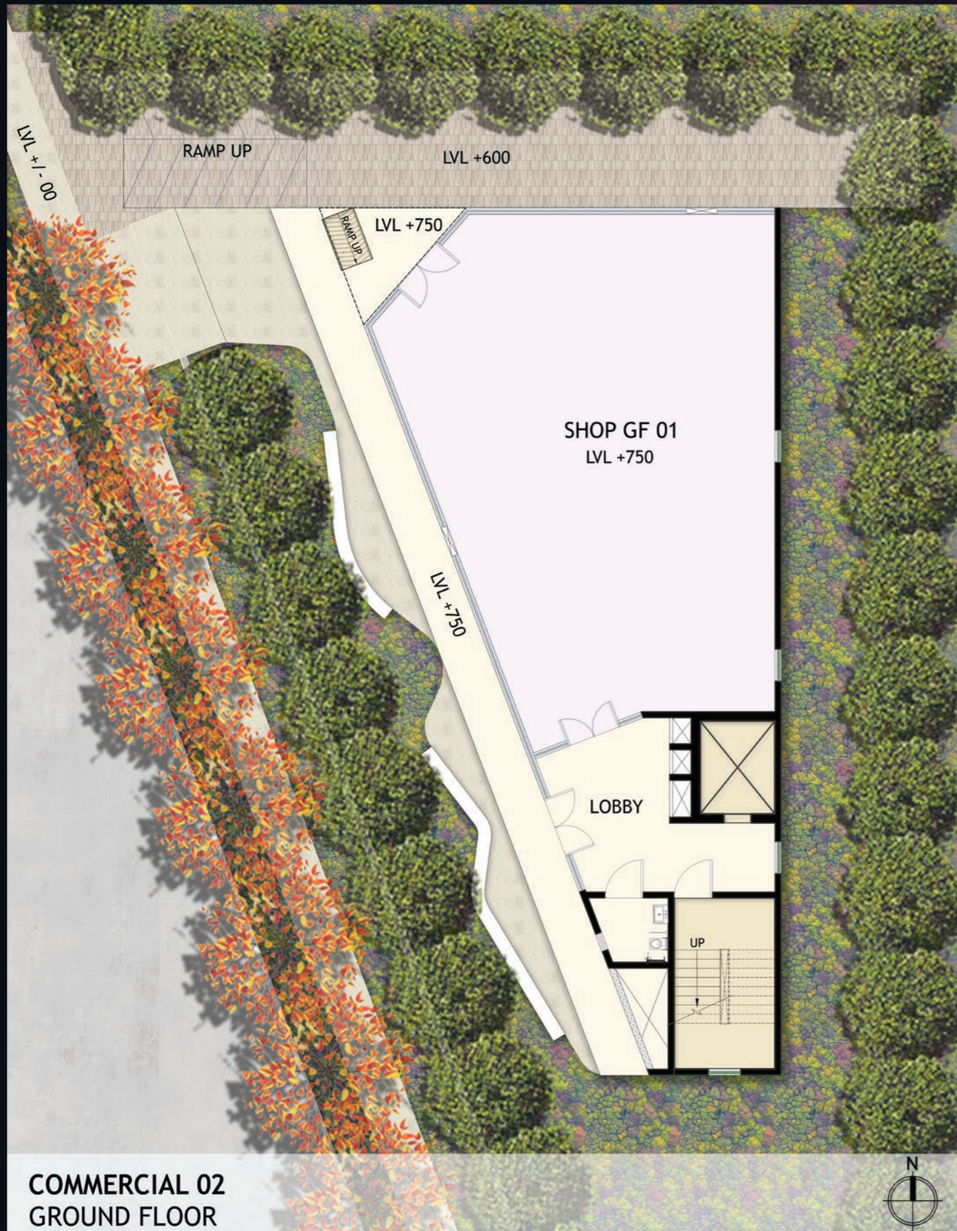
COMMERCIAL 02 GROUND FLOOR