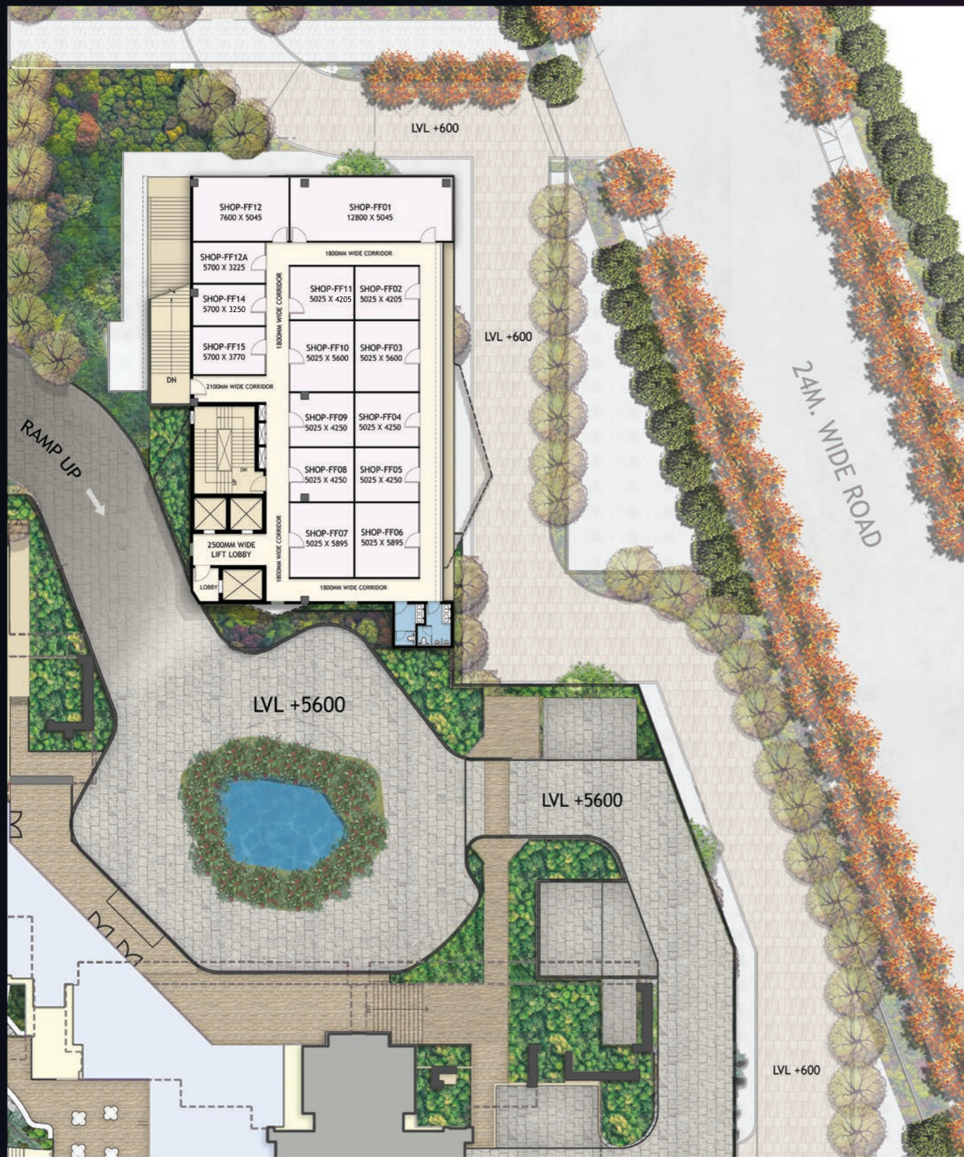
COMMERCIAL 01 FIRST FLOOR